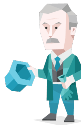
John D. Rockefeller